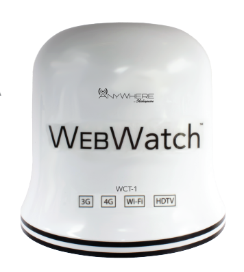
Kit Includes: Device, 25' cable, user manual

Now, you don't need another antenna for your TV. Access your favorite local TV channels through the WebWatch's built-in HDTV receiver. Web and Watch on your boat, recreational vehicle, cabin or AnyWhere else.