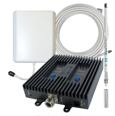
Kit Includes: (pictured items) • CA-VAT Amplifier • Outdoor Antenna • Indoor Antenna • Coax Cable • Antenna Ferrule • Antenna Mount • User Manual

The AURA 2G/3G Cellular Booster Kit is our entry-level marine kit that enhances virtually all US Carriers' 2G and 3G voice and data service. The AURA supports 7+ simultaneous users and a wide coverage area with clear calls and reliable service. Independently adjustable antenna balancing dial controls allow the user to adjust the boost for pinpoint signal enhancement. The AURA is backed by an industry-leading 3 Year manufacturer's warranty.