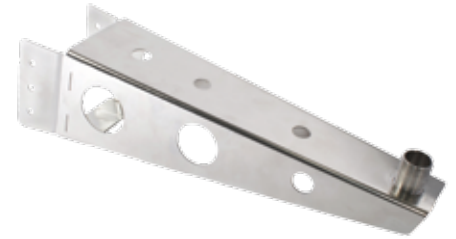
Kit Includes: Stainless Steel mast mount (mounting hardware not included)