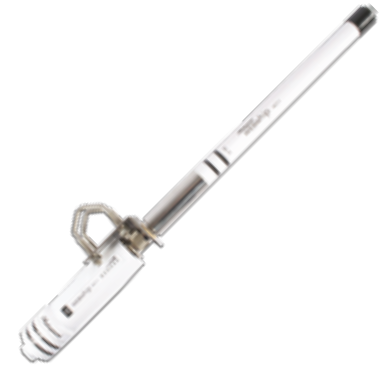
Kit Includes: Receiver, Antenna, Power Injector, DC Power Cord, AC Power Adapter, Mounting Kit (Mounting Rail size 7/8in - 2in [2.22cm - 5.08cm])

Stay connected to the world of information where ever you go. Increase the coverage of public hotspots with the WebWhip, our fully integrated Wi-Fi antenna, radio and router, for hassle-free internet reception on your boat, RV, cabin or AnyWhere® else. Access the internet directly through LAN or wirelessly, by connecting WebWhip to any standard Wi-Fi router. Manage the network without any software installation through any device with a web browser. Simple, powerful, AnyWhere.